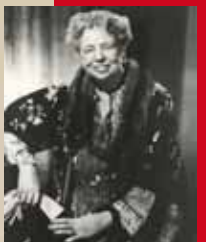
First Lady Eleanor Roosevelt

On the occasion of the opening of the Roosevelt Study Center in September 1986, President Ronald Reagan sent his best wishes from the White House.