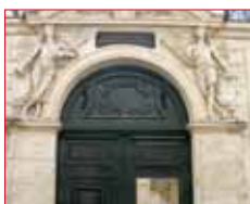
Sorbonne Nouvelle Paris