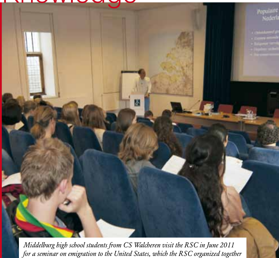
Middelburg high school students from CS Walcheren visit the RSC in June 2011 for a seminar on emigration to the United States, which the RSC organized together with the Zeeuws Archief.

The RSC runs both national and international Ph.D. seminars. A group of 10 Ph.D. students in American History and American Studies working in the Netherlands meets quarterly at the RSC to discuss the progress of their work and share new insights with visiting scholars. Alongside this, every two years the RSC organizes an international seminar which mixes this group with students from Cambridge, Paris, and Heidelberg.