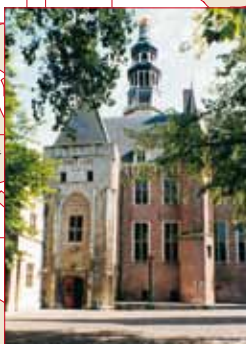
Roosevelt Study Center