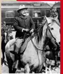
President Theodore Roosevelt