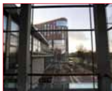
VU University Amsterdam