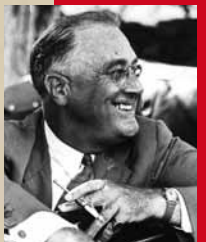
President Franklin Roosevelt