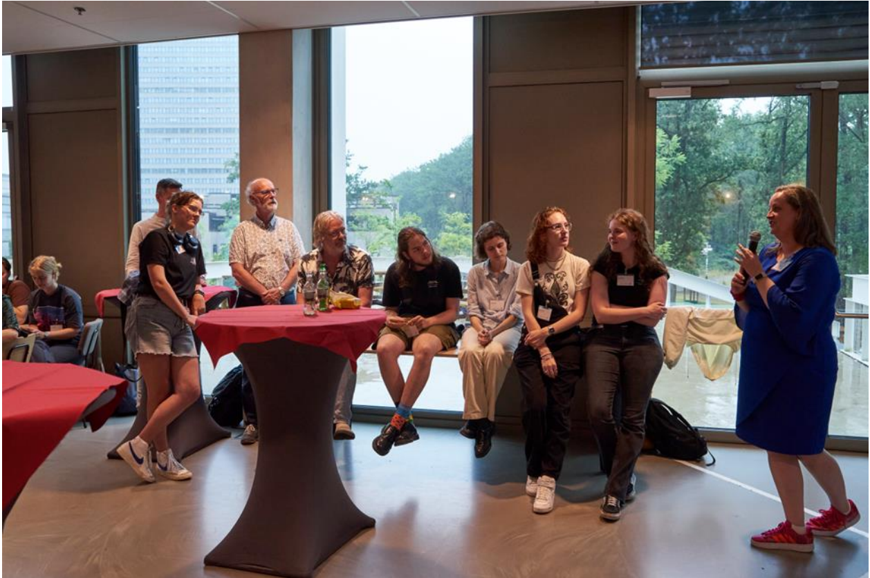
12 USA Nijmegen students and staff presenting sights and sounds of the American Studies trip to New Orleans