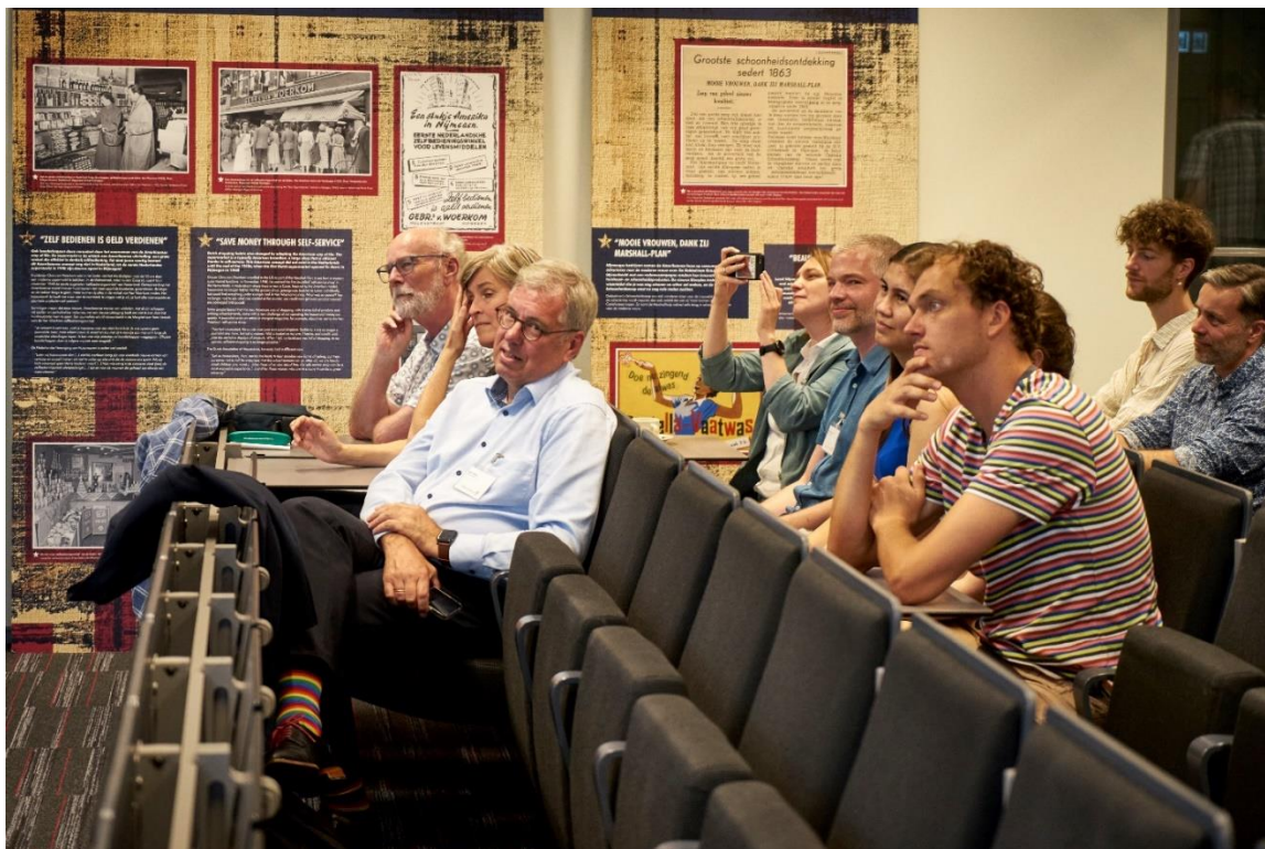
5 American Studies Day participants in front of panels of the exhibition "Nijmegen en het Marshallplan"