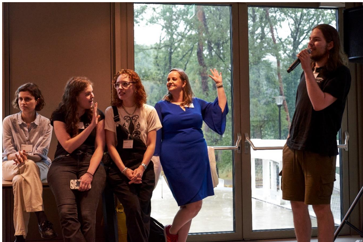
11 USA Nijmegen students and staff presenting sights and sounds of the American Studies trip to New Orleans