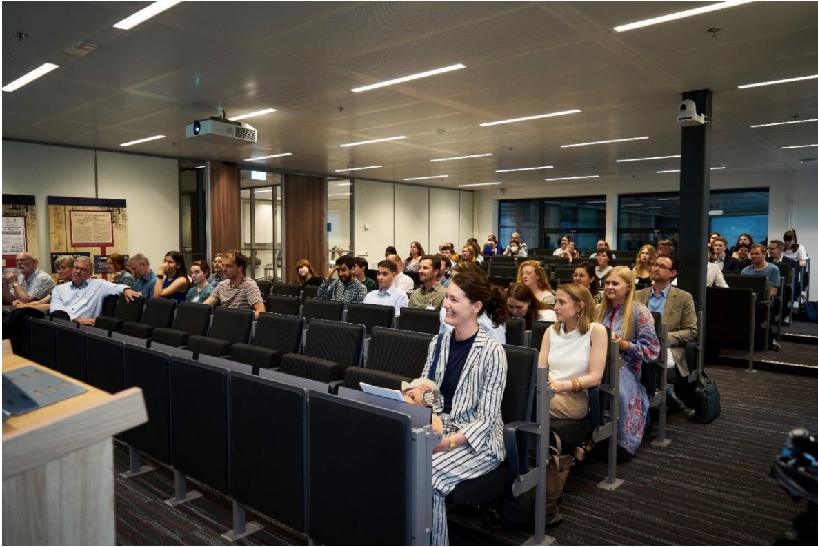
6 American Studies Day audience